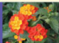
Native: Texas Lantana

Moppets Classes Tuesday-Friday, 9:30-11 A.M. Ages 3-5 Hiking, science, nature, animal education * Members only, 4-7 P.M.; Memberships available