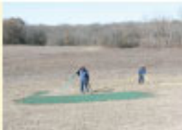
Hydromulch Services Applying native seeds using hydromulch