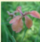
Native: Copper Iris

April 13-15 Members only: April 13, 4-7 P.M. Memberships available