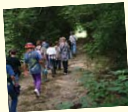
Guided nature trail