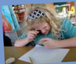
Studying tree rings