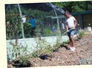
Young volunteer watering plants

Visit heardmuseum.org or call for pricing. Summer programs end Saturday, August 22.