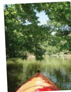
Heard wetlands view from kayak

The Heard Natural Science Museum & Wildlife Sanctuary is excited to offer a new canoe and kayak program in fall 2009. Families, scouts and groups interested in professional development will have the opportunity to learn to canoe or kayak while experiencing nature's beauty. The paddle program is comparable to the traditional guided nature trails in that groups will travel throughout the sanctuary, while learning about the wetland habitat and the animals that inhabit it.