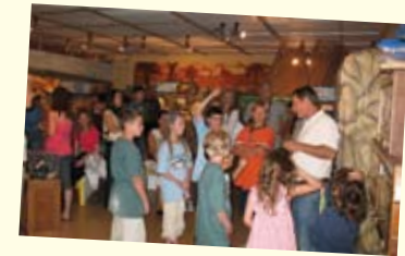
Kids love the live snake feedings

Live Raptor Presentation August 7 at 10:30