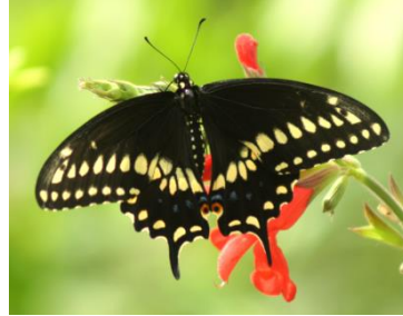
Eastern Black Swallowtail