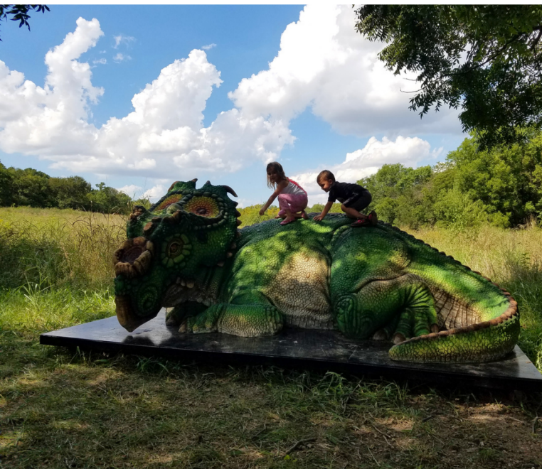
PHOTO OPS, PLAY DINOSAURS AND MORE

PLAY PARASAUROLOPHUS PLAY APATOSAURUS FOSSIL DIG HADROSAUR T-REX PHOTO-OP PACHYRHINOSAURUS PHOTO-OP